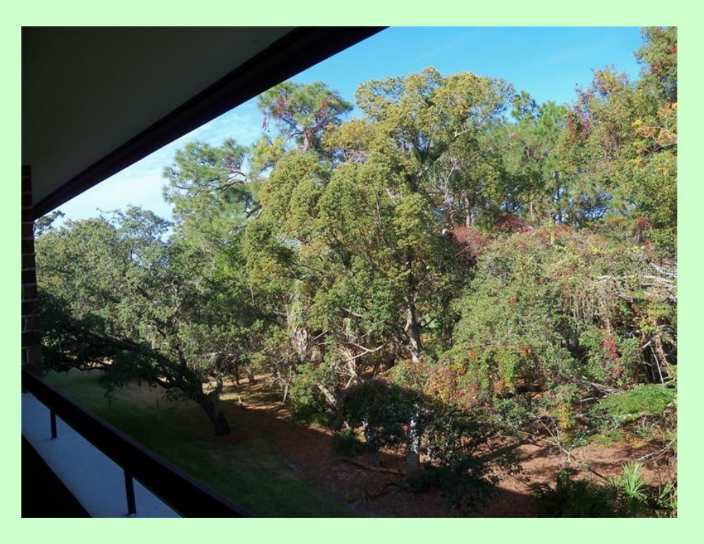
MLS #U7822171: "A2" Unit - 3rd floor - Prestwick Lodge

Looking for your piece of Innisbrook, look no further. For peace and privacy this is it. This condo is tastefully decorated and ready for you to move right in. Two queen pillow top beds and a queen size sleeper sofa offer plenty of sleeping space. Relax on the 3rd floor balcony overlooking the North Course. Convenient to the Peacock swimming pool. Perfect for your golf get-away or vacations.