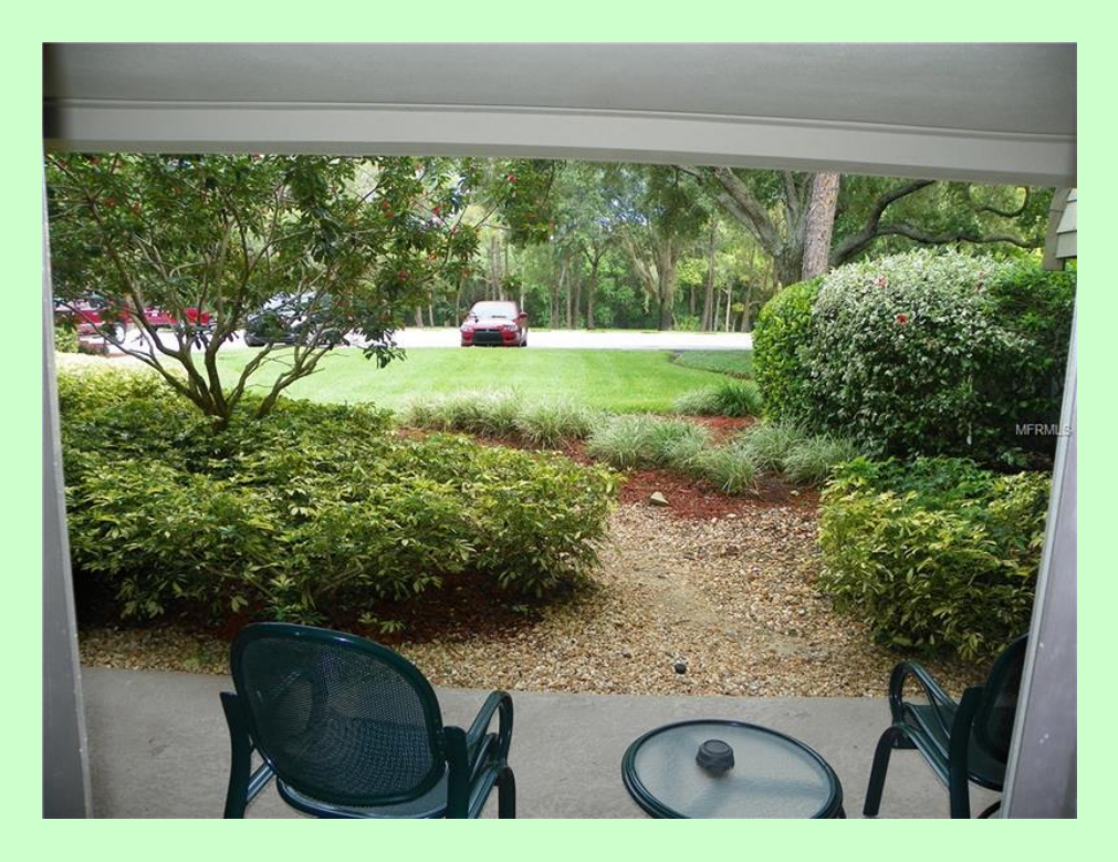
JUST LISTED! NEWLY LISTED AT $79,900

MLS #U7822706: "A1" Unit - 1st floor - Muirfield