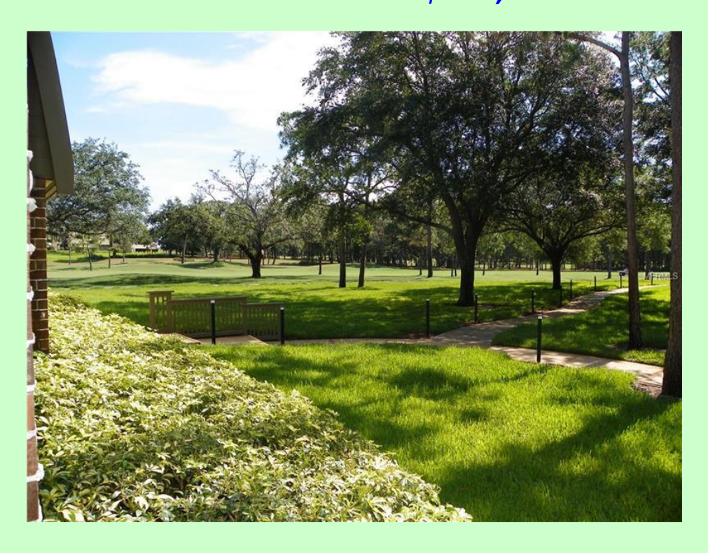
MLS #U7820049: "D" Unit - 1st floor - Dublin Lodge

Enjoy the convenience of Resort living in this desirable ground floor 2BR/Den/2BA condo. Offering almost 1,700 sq ft of living space, this is the perfect vacation retreat! Kitchen has granite counters and plenty of cabinets. With a current membership, you can even order room service! The open living room/dining area is great for entertaining. There is an accordion door separating the living room from the den area so can easily be closed off if you need another private sleeping area. Guest bedroom has a queen size bed and large closet. Guest bath has glass enclosed stall shower while master bath has the tub/shower combination. Master bedroom has a king size bed and laminate flooring. Relax on the corner patio with views of the famous Copperhead course. Call us today to make an appointment to see this condo!