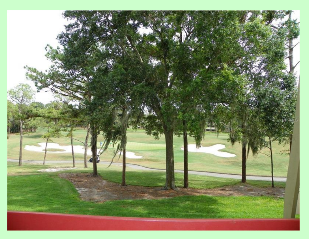
MLS #U7822178: "B" Unit - 2<sup>nd</sup> floor - Merion Lodge

Relax on the 2nd floor tiled balcony with a picture perfect open view of the Copperhead Golf Course par 3 #15. Beautifully decorated with commercial grade furnishings in a tropical motif. Open living room/dining room is nice and bright with sliders to the balcony. Queen size sleeper sofa is available for guests. The master bedroom has a king size bed and sliders to the balcony. Centrally located in the heart of the Resort. Easy walk to either the Copperhead Clubhouse, Pool and Hot Tub, or Osprey Clubhouse and Lochness Pool. Perfect for your yearly golf vacations!!