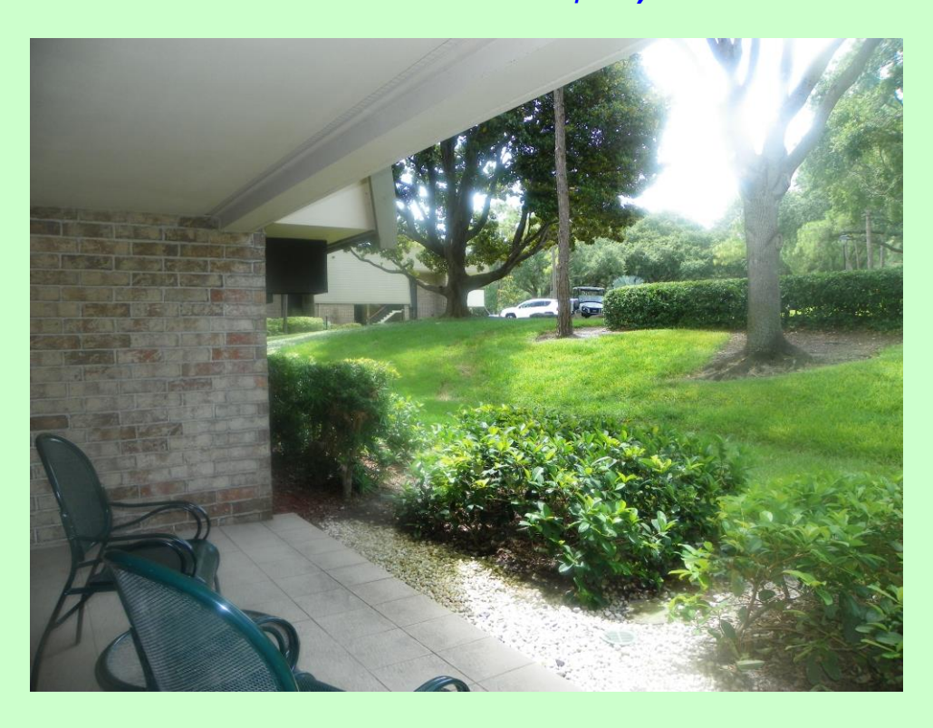
MLS #U7823182: "A1" Unit - 1st floor - Merion Lodge

Turnkey and ready for your next vacation, this stunning studio condo is updated to the newest rental pool standard, complete with crown molding through-out, newer carpeting, and commercial grade furniture. The queen sleeper sofa and pillow top king bed is perfect for a couple or small family's get-away. Kitchenette provides stove, microwave and under the counter refrigerator, just enough to make some quick meals. Relax on the spacious patio after a round of golf or a game of tennis. This condo is on the end of the lodge so you have only one adjacent neighbor, and it is centrally located with easy access to both the Copperhead Clubhouse and pool and the Osprey Clubhouse and Loch Ness Pool and just a stone's throw to the main practice range.